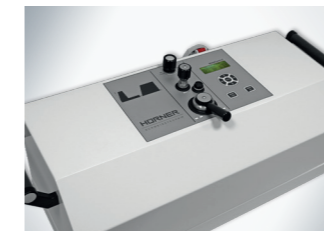
Front panel with GT keypad