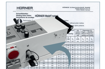
WeldControl jointing – no errors, no welding parameter look-up, but data recording